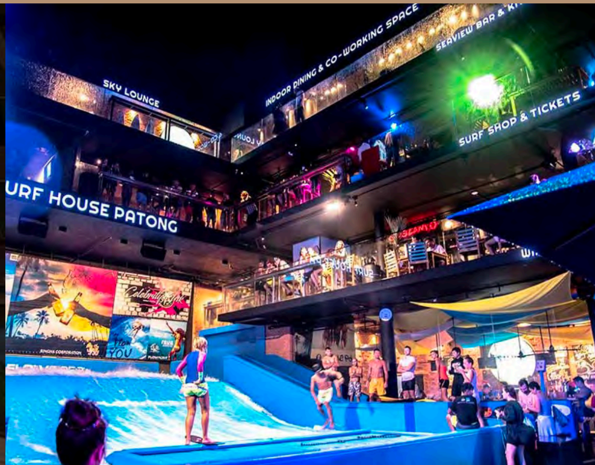
SURF HOUSE PATONG BEACH