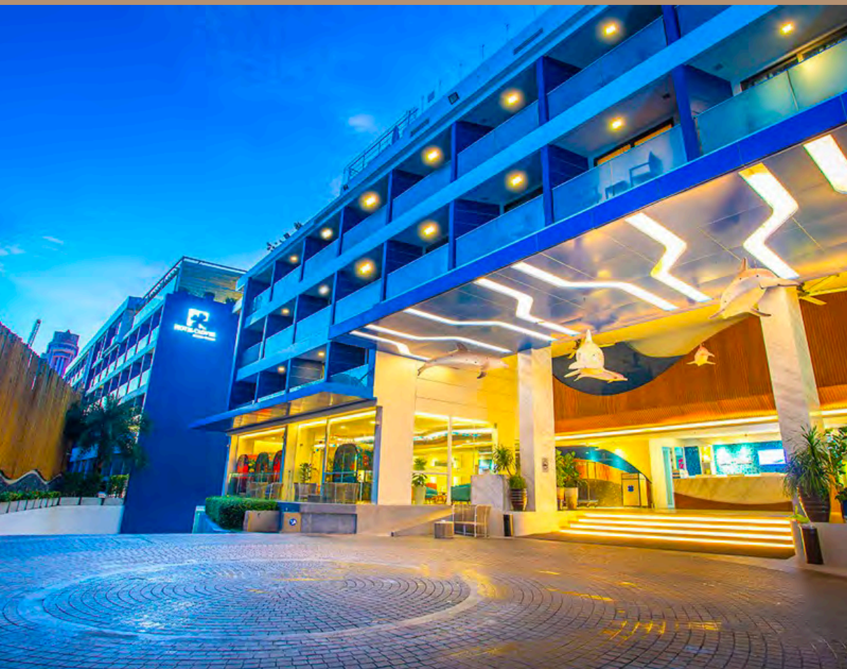
HOTEL CLOVER PATONG