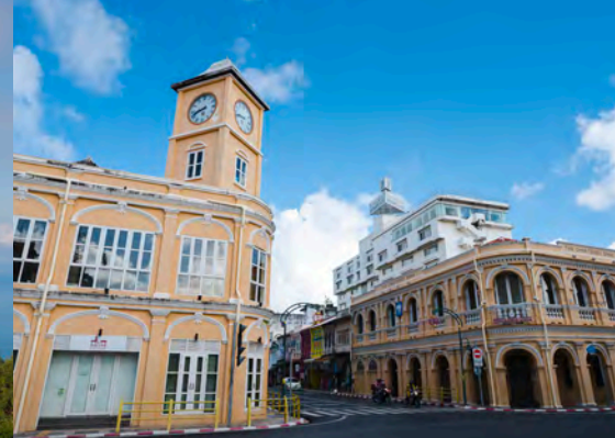
PHUKET OLD TOWN