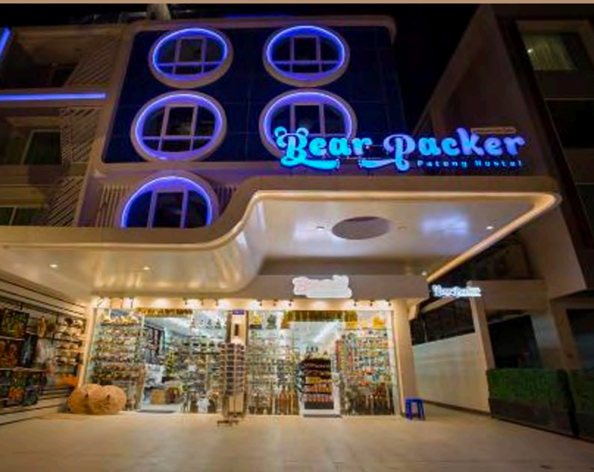
BEAR PACKER PATONG HOTEL