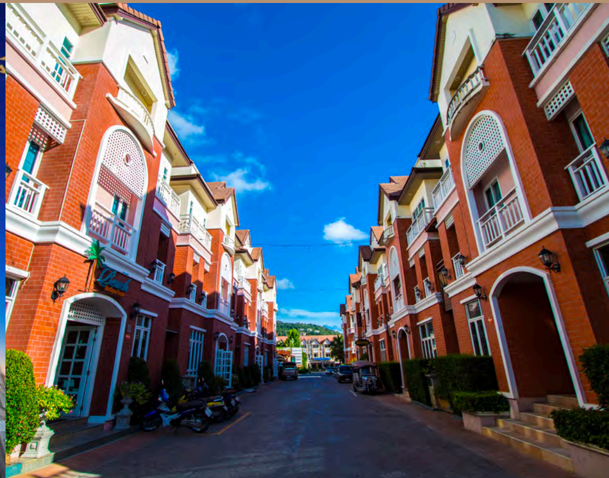
THE BEACH BOUTIQUE HOUSE