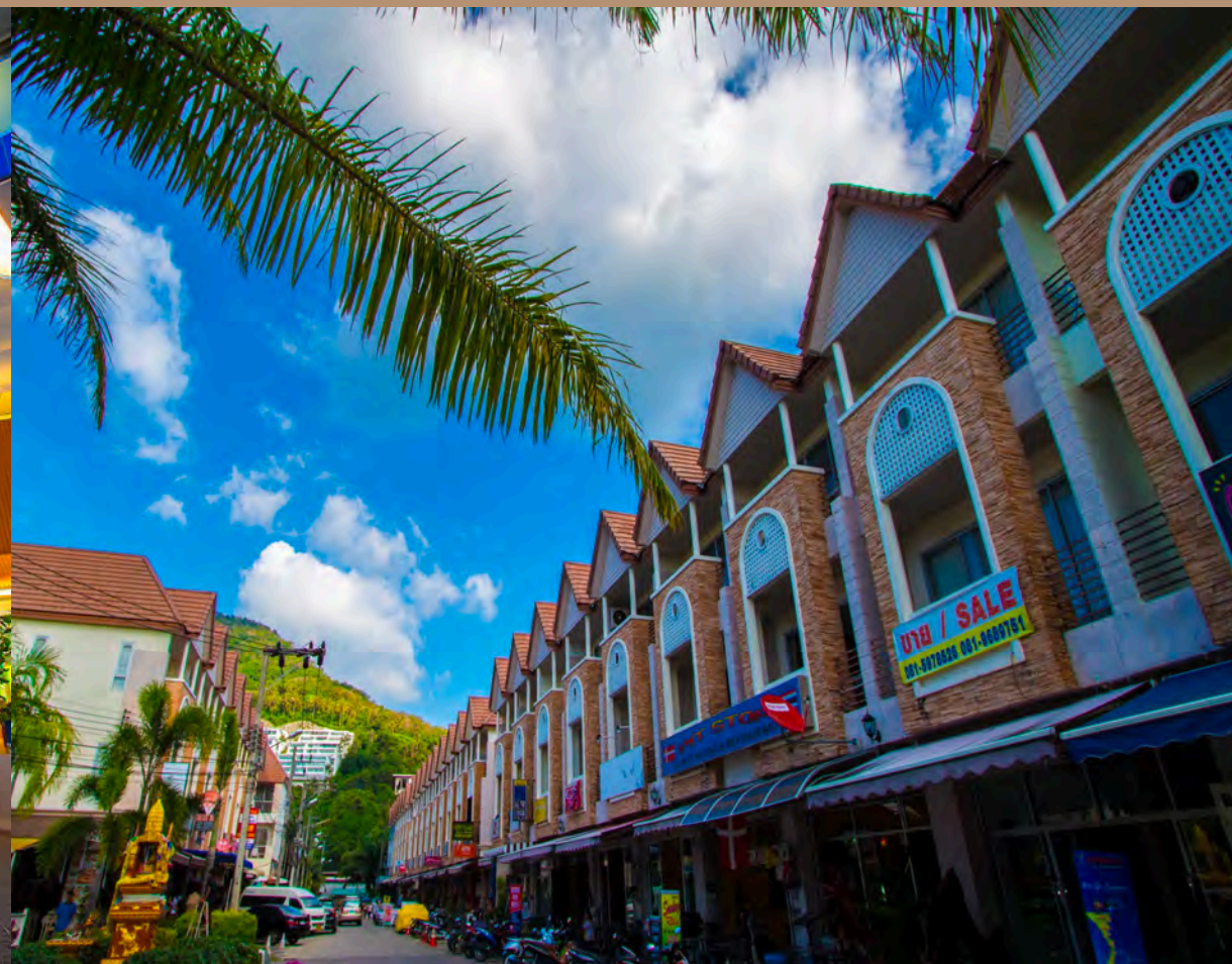
THE BEACH CENTER TOWN HOME