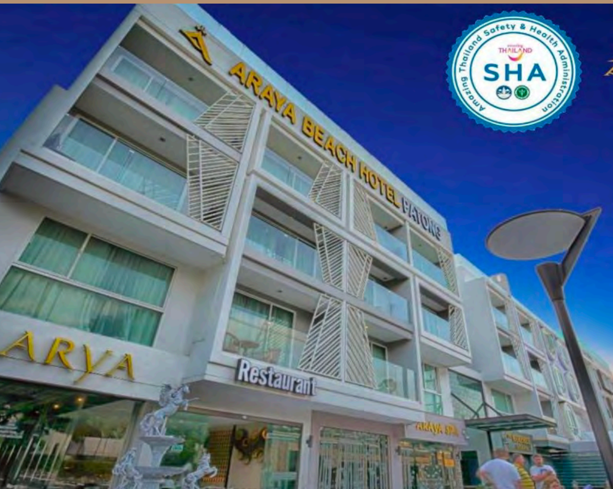
ARYA BEACH HOTEL