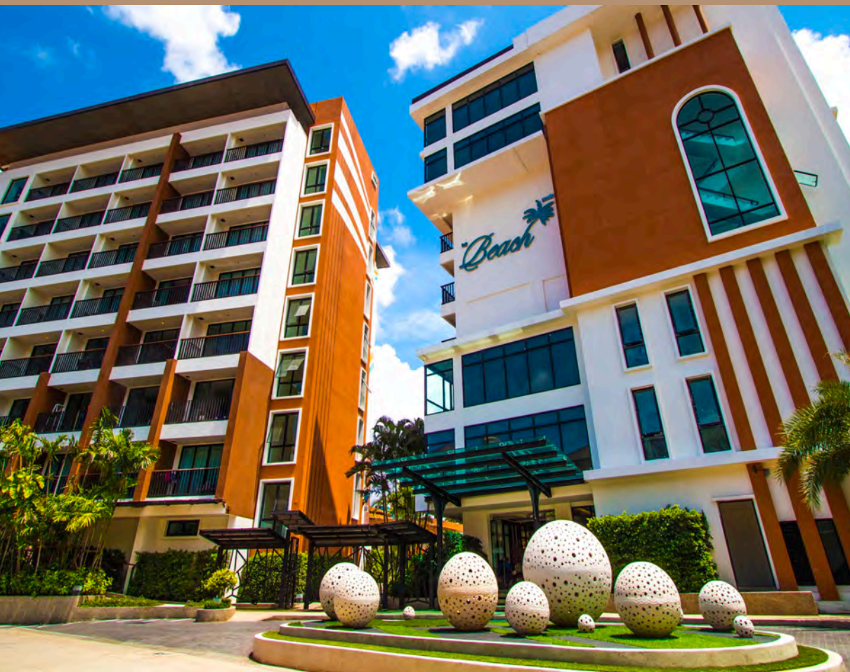
THE BEACH CONDOTEL