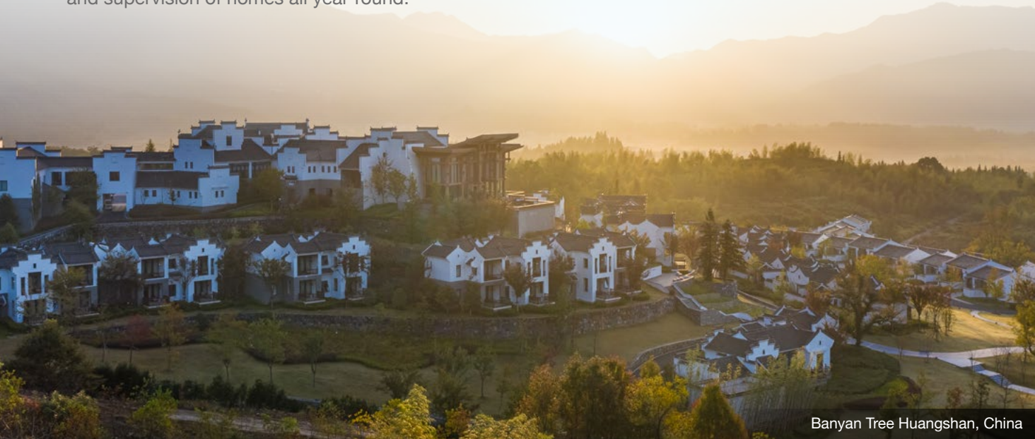
Banyan Tree Huangshan, China

Our Group prides itself on the dedicated management of its properties, along with a generous array of services and amenities committed to nothing short of excellence. A 24-hour concierge is readily available to homeowners, and a professional team will always be on hand to assist in maintenance and rental services. Ensuring top-tier administration and supervision of homes all year-round.