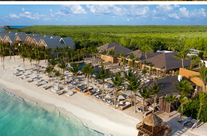
Banyan Tree Mayakoba, Mexico