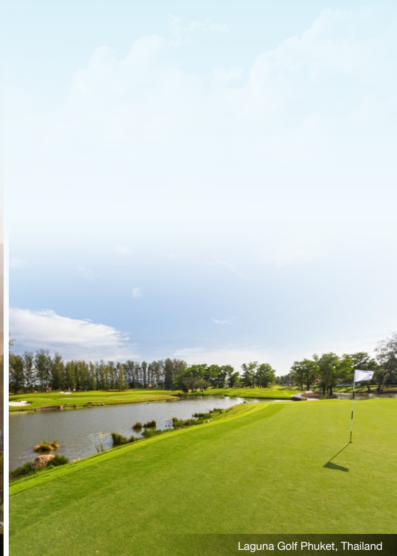
Laguna Golf Phuket, Thailand